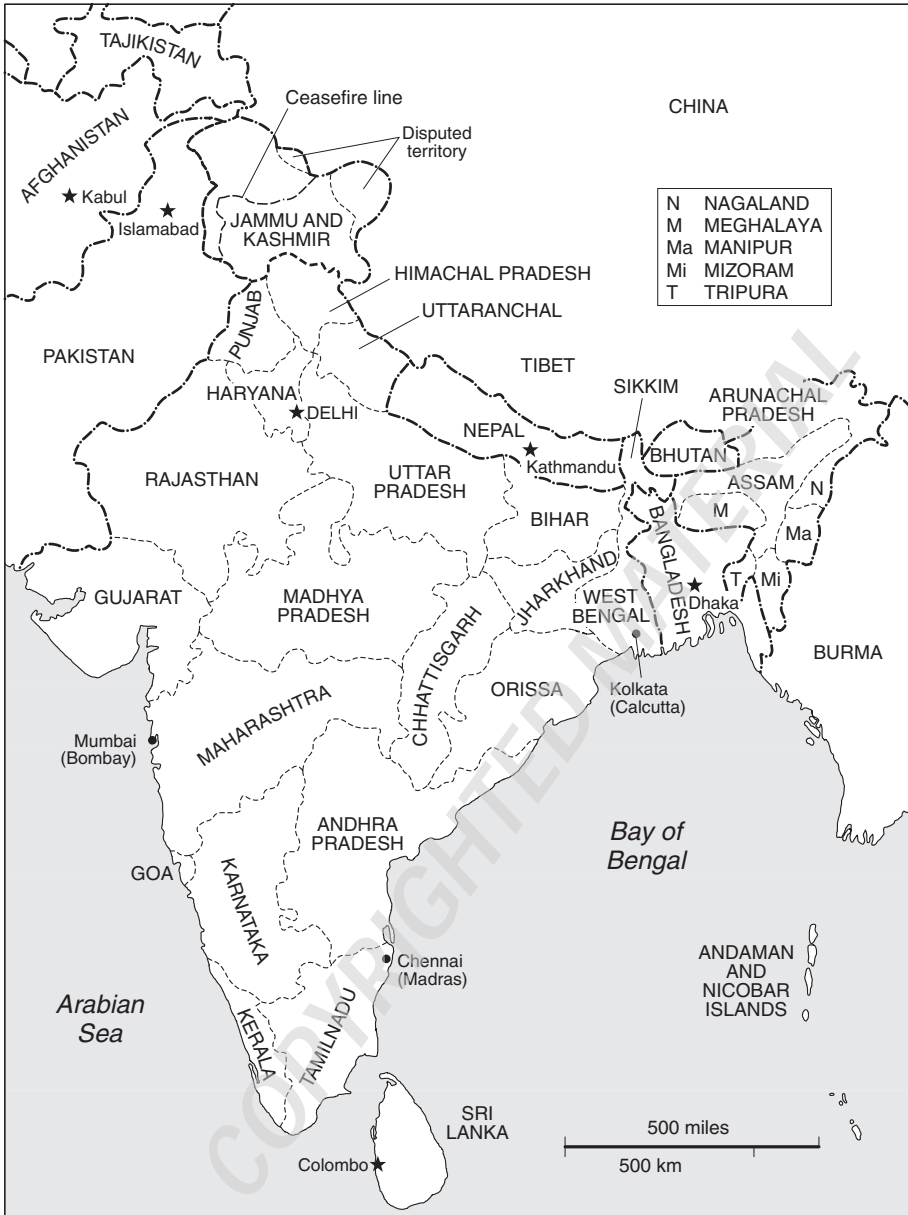
Map 1 India today.