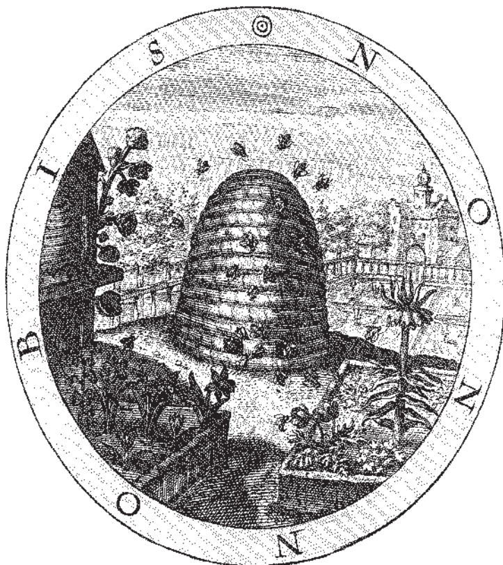
Engraving illustrating a sixteenth-century work on apiculture: the words Non nobis indicate that the bees themselves do not profit from the honey they make.

bring a single litre of nectar back to the hive, and five litres of nectar make one litre of honey.