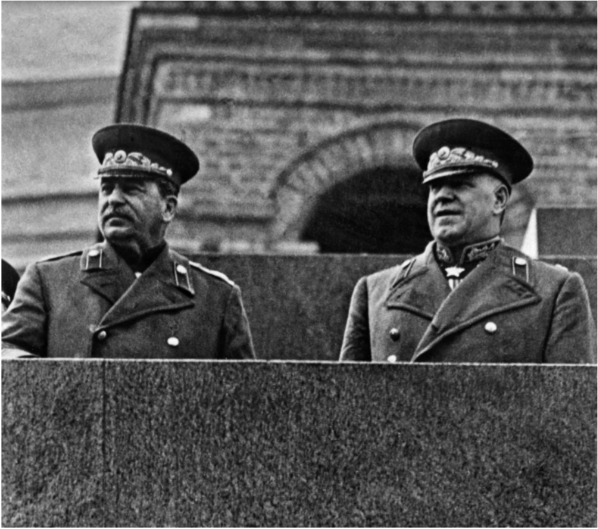
FIGURE 1.2 Stalin and Zhukov on the Lenin Mausoleum, 1945. The Party and the military in uneasy equilibrium.