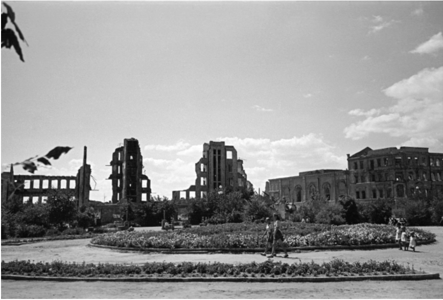
FIGURE 1.1 Stalingrad, summer 1945.