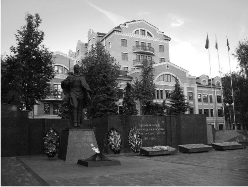
FIGURE 1.4 War memorial, Zvenigorod, west of Moscow, August 2007. The memory of the war is manifestly alive in this small town, which saw terrible bloodshed in 1941. In September 2009, the local authorities announced the imminent construction of an improved granite memorial engraved with the names of the 149 local inhabitants who died in the fighting.