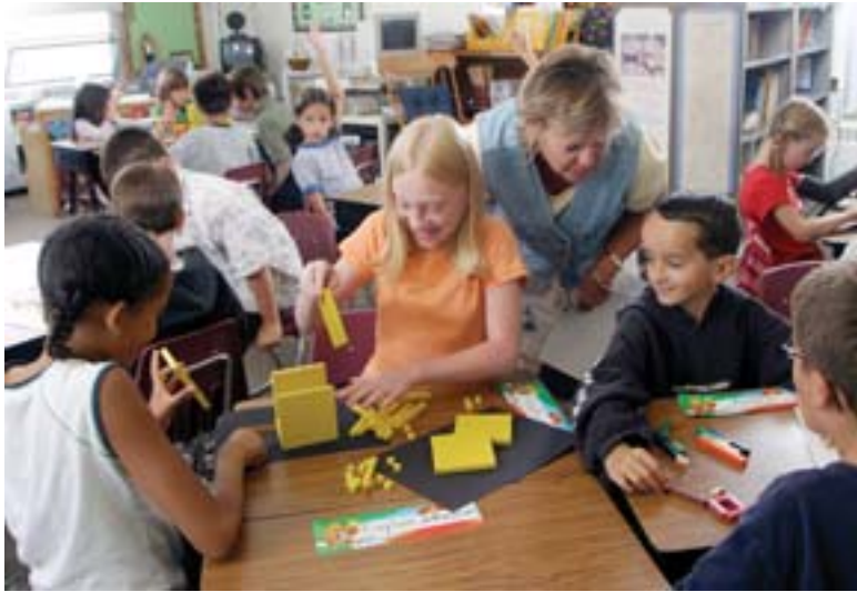
Managing multiple tasks at once is one of the demands of teaching.

The greatest reward of teaching, however, is seeing your students grow and learn. As a teacher, you can take pride in helping your students make progress—in specific skills, in deep knowledge of a subject, in the ability to become independent and make choices about their futures, and in their use of what they have learned. At whatever grade you choose to teach or in whatever subject, you must derive great satisfaction in watching your students "get it," in watching the light bulbs go on in their minds, and in seeing how they learn to grasp new concepts and think in more complex ways. If you teach first grade, this often means you will have the satisfaction of teaching children to unlock the code of written language and learn to read. If you teach middle school mathematics, this can mean watching your students master algebra for the very first time. If you are a high school music teacher, it might mean listening to students play the first compositions they wrote for a class assignment—and finding a few gems among them. Such rewards should drive teachers at every level—from preschool to elementary to middle school to high school.