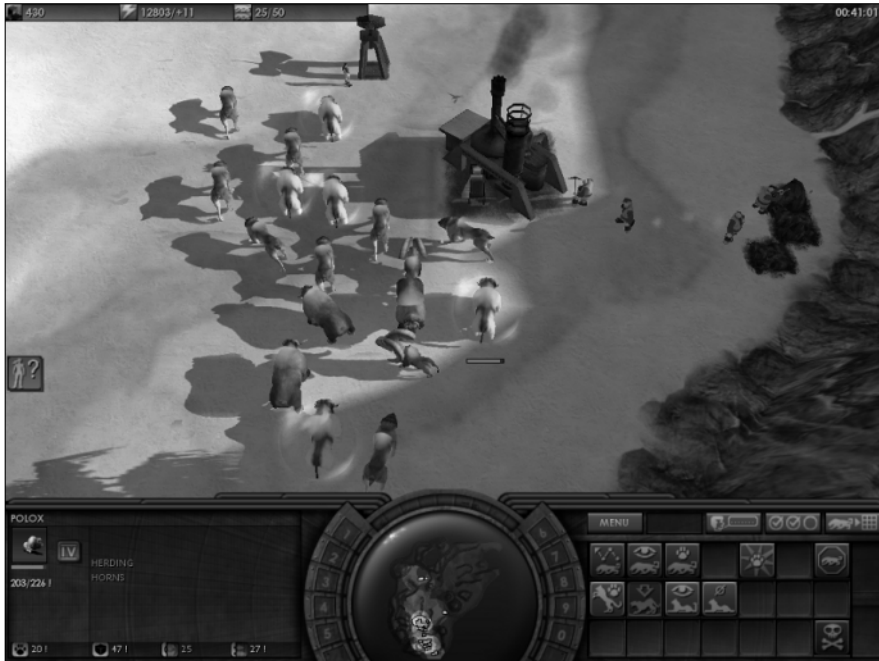
Figure 1-2: A favorite multiplayer network classic game, Impossible Creatures.

What's that you're saying, Bunky? You're tired of predictable computer opponents in your favorite games? Hordes of zombies in Half-Life 2 that you can handle in your sleep? How about timid enemy monsters that don't attack you or ambush your character in Microsoft's Impossible Creatures (as shown in Figure 1-2)?