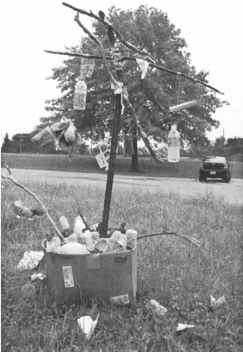
Figure 1.1 This piece of public art created by Michigan children shows the obvious concerns that young consumers have about sustainability. The “Trash Tree” sculpture was accompanied by a sign explaining that 80% of what Americans throw out is recyclable, though only a fraction of that is actually recycled.