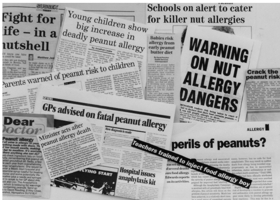
Fig. 1.2 Newspaper cuttings related to food allergies.

they need to know how to treat themselves when things go wrong. But it was common to hear it reported that a general physician (GP) faced with a young allergic patient had told the child's parents: 'If you think he's allergic to nuts, the solution is simple – don't give them to him.' This is easier said than done, and frequent close calls and occasional deaths occur.