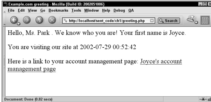
Figure 1-1: A result of preprocessed PHP

If you peek at the source code from the client browser (select Source or Page Source from the View menu, or right-click if you're using the AOL browser), it will look like this: