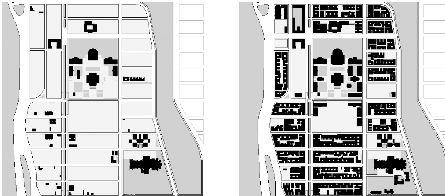
Figure 1-1 A comparison of Morningside Heights in Manhattan from 1897 and 1915 illustrates the astonishing pace of development in the neighborhood. In 1897, when the development of the adjacent Upper West Side had just been completed, the only buildings in Morningside Heights were institutional: colleges, a cathedral, and a hospital. Less than two decades later, the building fabric was entirely filled in with residential buildings, designed and constructed by interconnected groups of investors, architects, and builders.

a mix of residential unit types above, surrounding a deck of dedicated, shared, and public parking, is far from “instant.” But the complexity, especially in the hurried atmosphere of a charrette, tends to default to the formulaic. Despite occasional instructions such as Columbia Pike’s “Keep the Pike Funky,” form-based codes risk dumbing down design when they are overly prescriptive about style. In their efforts to raise the bar on the design’s relationship to the urban context, they can also lower the bar on the designer’s ability to incrementally improve the architecture of the place. Designers sometimes self-deprecatingly refer to their “wallpaper” facades. Too much of this uniformity, even in relatively high-density retrofits, results in a pervasive air of predictability and control that is more suburban than urban—at least at first.