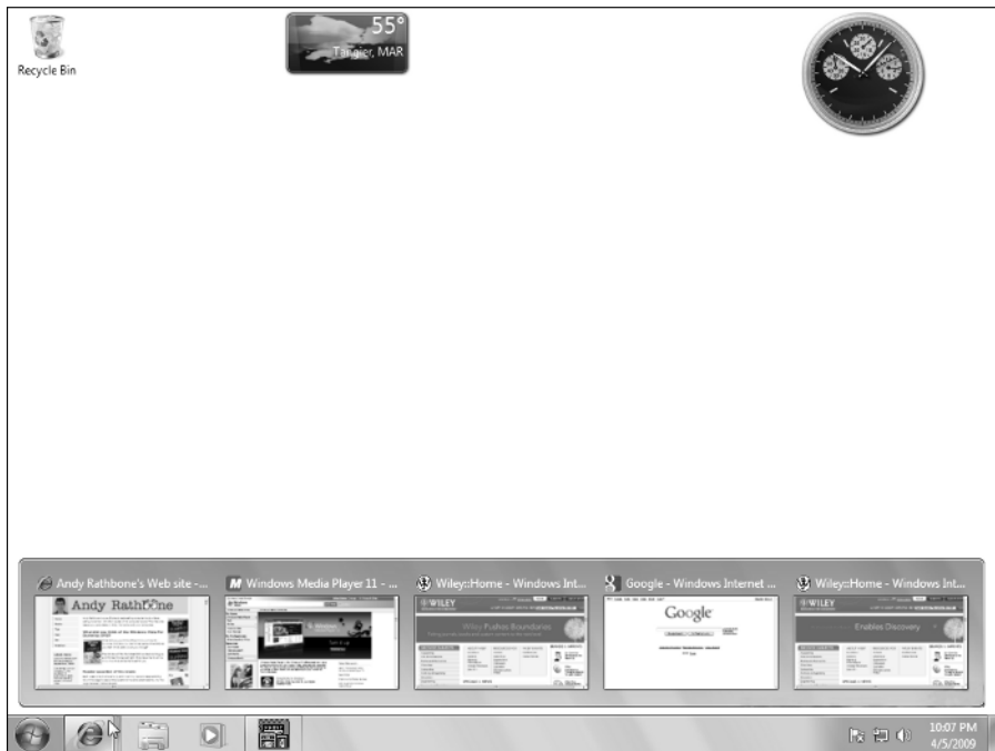
Figure 1-2: The new taskbar in Windows 7 offers pop-up thumbnail previews of every open window on your desktop.