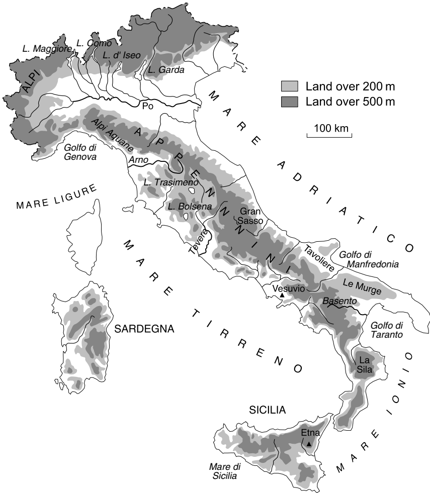
Figure 1.2 Italy: main relief.

south, several distinctions can be made. In a number of small regions that initially lost population, there was significant manufacturing job growth. Calabria lost ground marginally on both indicators. The regions containing the large cities of Naples and Bari, the islands and Lazio saw strong population growth but relatively small increases in manufacturing jobs per resident.