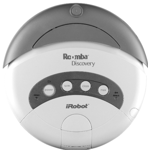
FIGURE 1-9: Roomba 2.1 for the Home Shopping Network