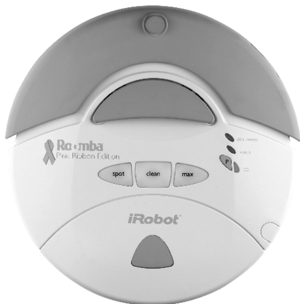
FIGURE 1-8: Roomba Pink Ribbon Edition