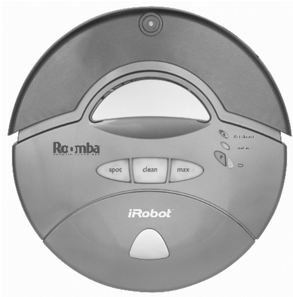
FIGURE 1-5: Roomba Sage