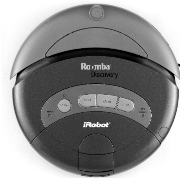
FIGURE 1-7: Roomba Discovery SE