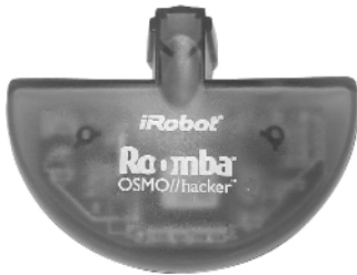
FIGURE 1-12: The OSMO//hacker

This is a one-time use device that plugs into the Roomba to be upgraded. The OSMO//hacker upgrades the Roomba and from that point on, the module is no longer needed.