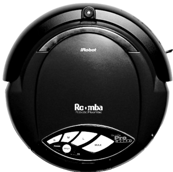
FIGURE 1-3: Roomba Pro Elite