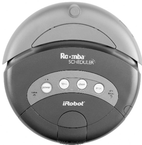
FIGURE 1-10: Roomba Scheduler