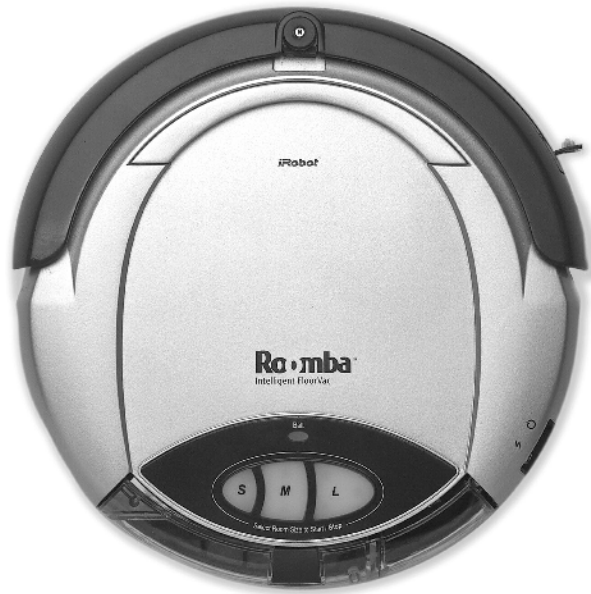
FIGURE 1-1: The original Roomba

through its S, M, and L buttons. It shipped with at least one virtual wall (a special battery-powered infrared emitter used to create virtual boundaries) and a plug-in battery charger.