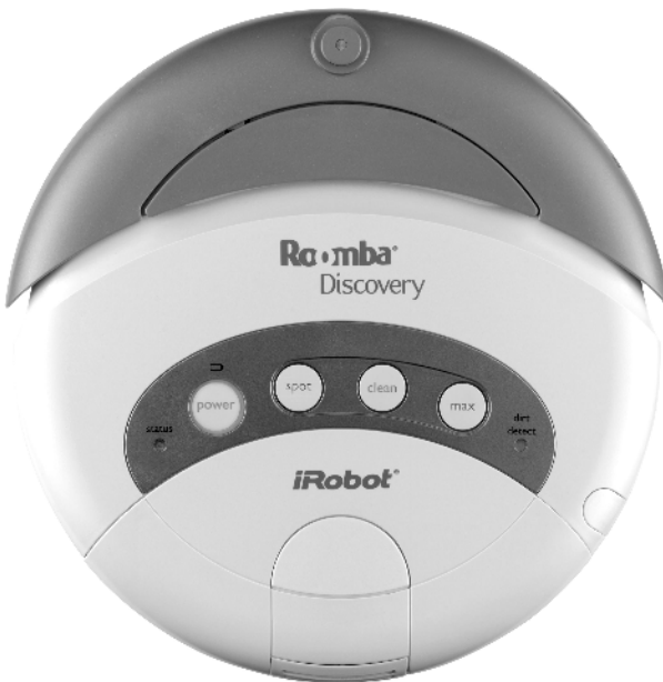
FIGURE 1-6: Roomba Discovery