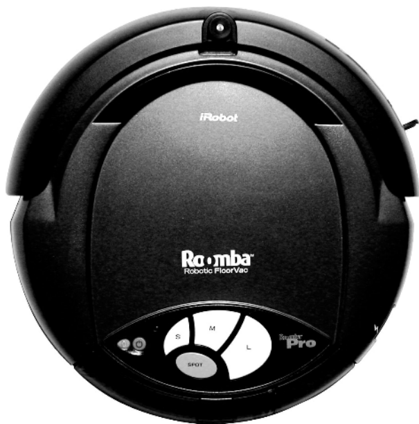
FIGURE 1-2: Roomba Pro