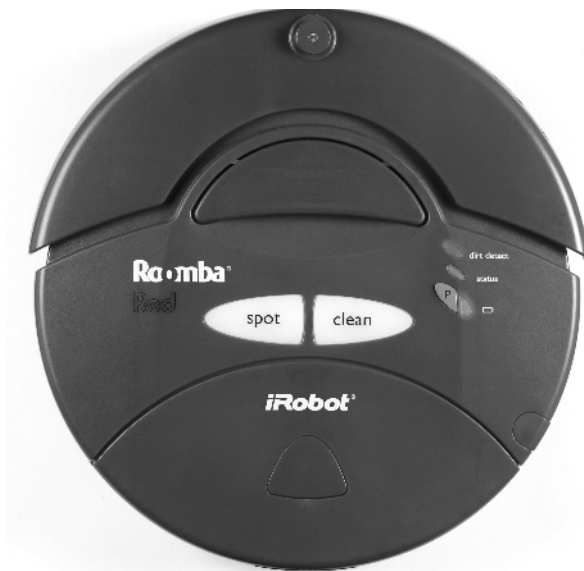
FIGURE 1-4: Roomba Red