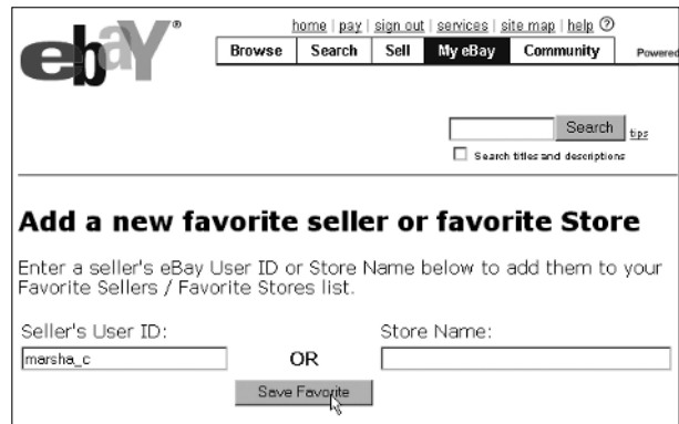
• Figure 1-11: Adding a new favorite seller.

You can save up to 30 sellers or stores on this page.