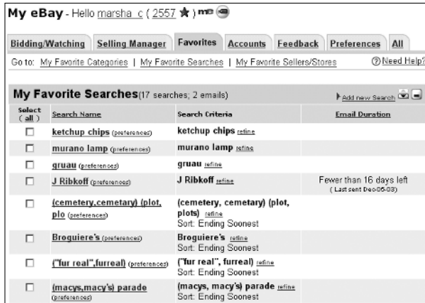
• Figure 1-10: My eBay Favorite Searches.

Figure 1-10 shows you my personal My eBay Favorites tab. (No laughing when you see the favorite searches — if you ever meet me, just ask me about them.) This tab is where your favorite search shows up after you’ve recorded one. You can also record a search from this page by clicking the Add New Search link in the top bar.