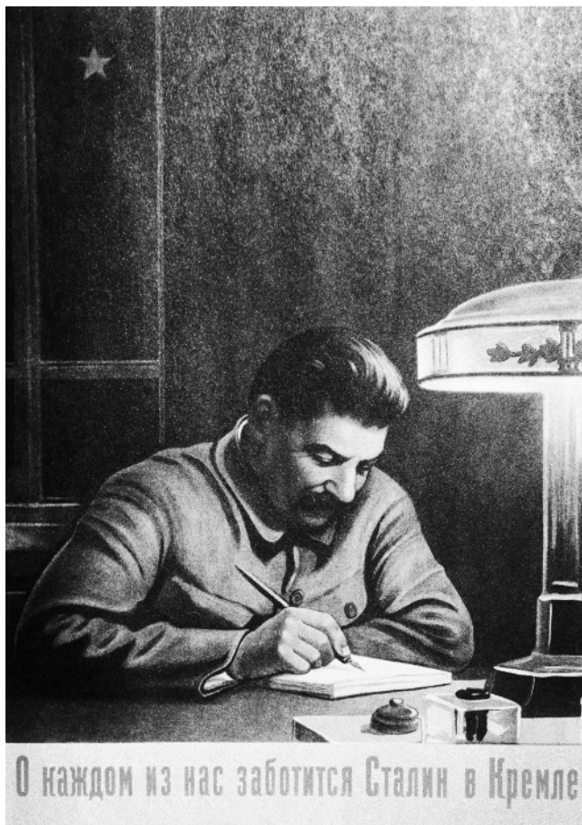
FIGURE 1.2 Viktor Govorkov, "Stalin in the Kremlin Cares about Each One of Us." 1940.

During these terrible years millions were arrested and disappeared into the Gulag (forced-labor camp) system, many never to return. Hundreds of thousands were shot as spies, wreckers, and Trotskyites. An anonymous denunciation would frequently lead to arrest, even without any concrete proof – causing thousands of unscrupulous individuals to settle personal scores, denounce neighbors with attractive apartments, accuse their boss (to rise professionally), and the like. There is perhaps some poetic justice in the fact that 20,000 NKVD (secret police) operatives were also swallowed up in the arrest wave, including the head secret policeman in 1936, Genrykh Yagoda (executed in 1938). The arrest and disappearance