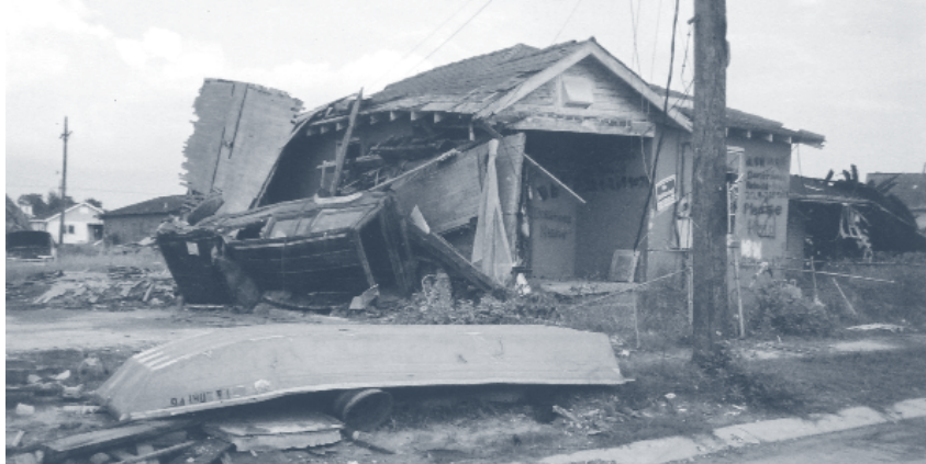
Katrina aftermath: this Ninth Ward house is a few blocks from of the Alvar Street Branch library